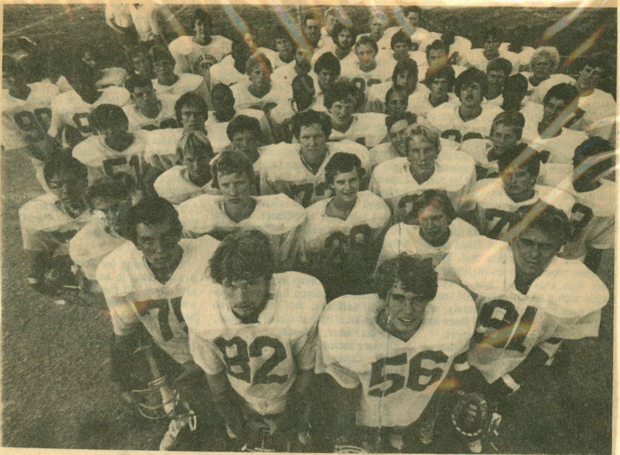
The 1983 version of the Sussex Central Golden Knights.